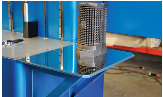
Option: extended working tables